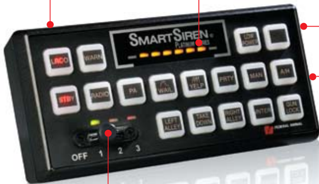
SmartSiren Platinum Remote Control Head

SmartSiren Platinum allows you to make volume adjustments easily with radio and rebroadcast control through easy-access holes on the control head.