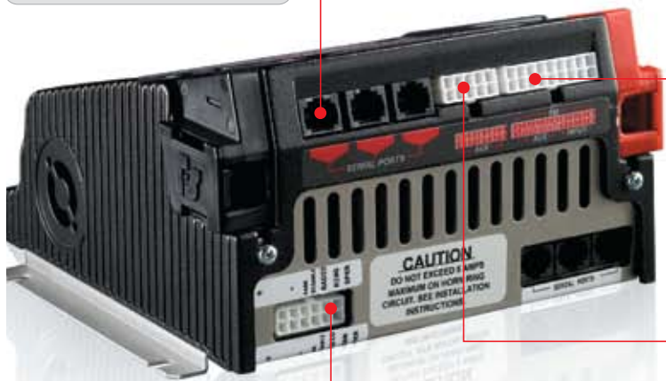
SmartSiren Platinum Amplifier - Rear View

SmartSiren Platinum redefines how your vehicle's control system operates. Utilizing Federal Signal's unique Convergence Network, the amplifier's design allows for quick and easy "plug and play" serial communication. The locking relay connectors provide secure inputs and outputs for additional auxiliary operation.