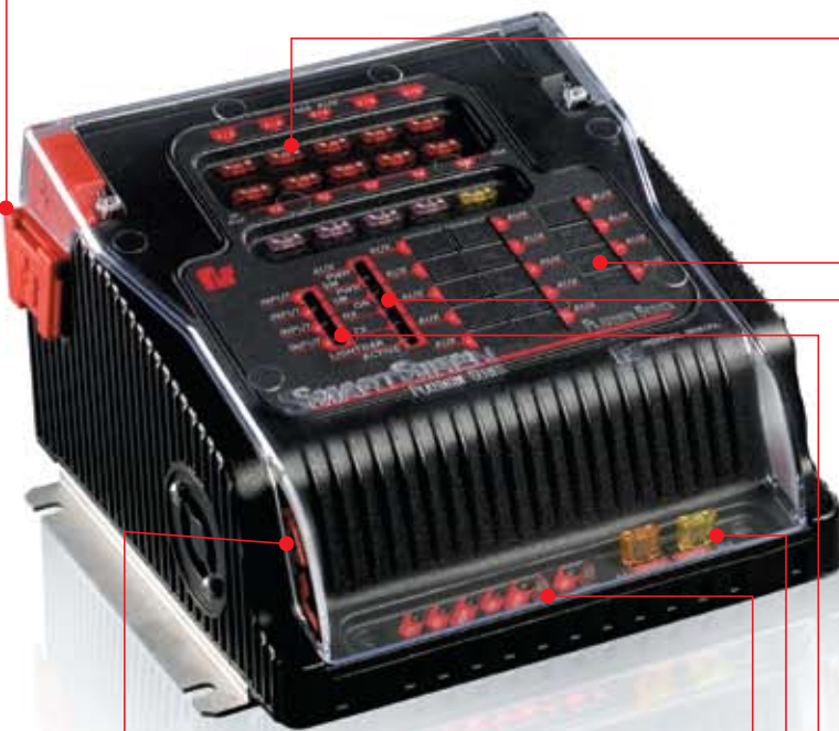
SmartSiren Platinum Amplifier - Front View