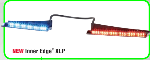
NEW Inner Edge® XLP