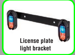
License plate light bracket