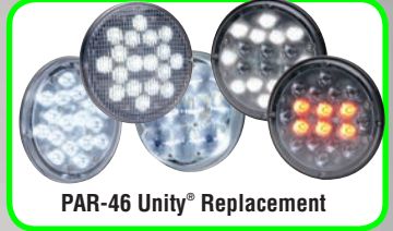
PAR-46 Unity® Replacement