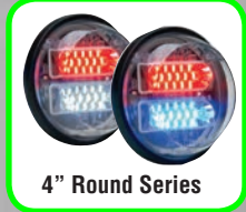
4" Round Series