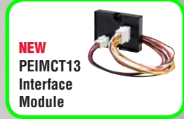
NEW PEIMCT13 Interface Module